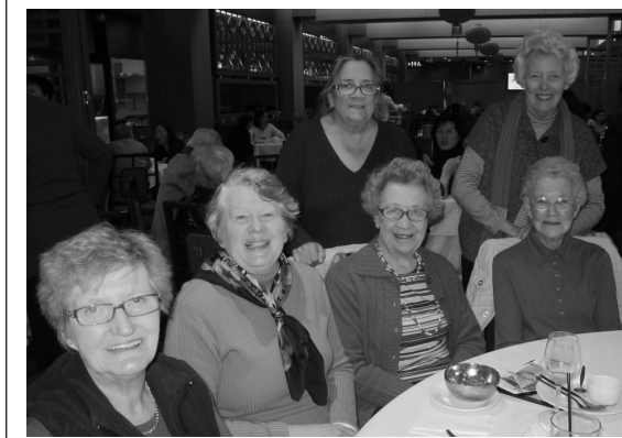
August Social Club Outing to Yum Cha at Parramatta. What a scrumptious lunch!